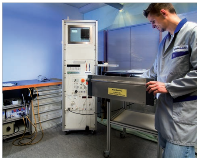
Using flexible application engineering we carry out all device specific and customer-specific tests