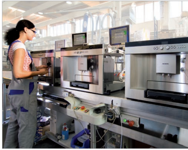
Full service: from the idea to final assembly