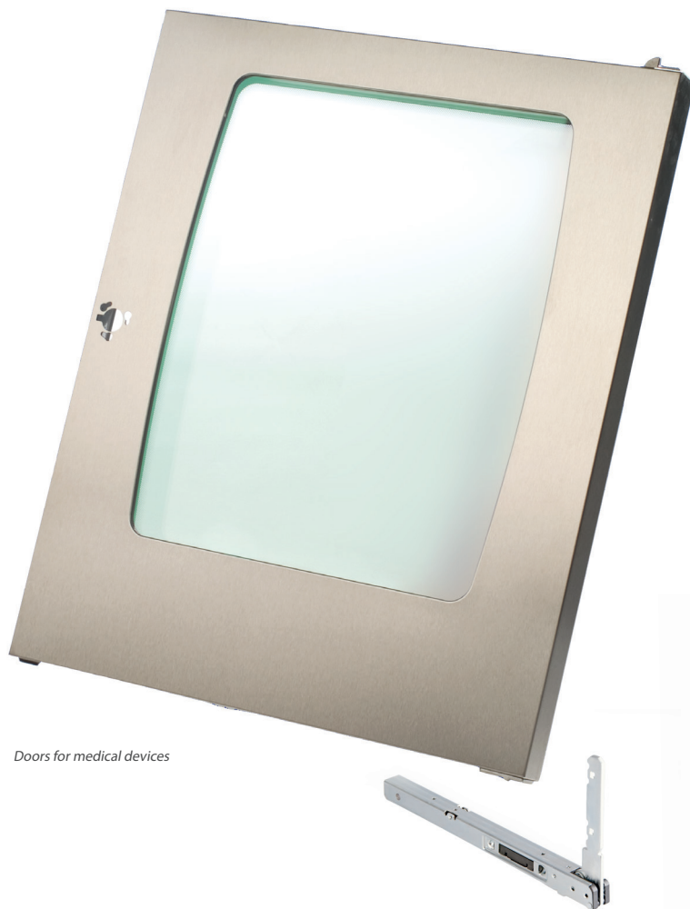
Doors for medical devices

In addition to individual components for metal production and plastics technology, we are also your contact for the development, design and delivery of complex components, e.g. doors for medical (built-in) devices, heating drawers, cabinets, frame constructions, front panels, handles, hinges, fitness and wellness accessories, OEM devices and much more. GRONBACH is involved in the series production of medical assemblies according to customer specifications.