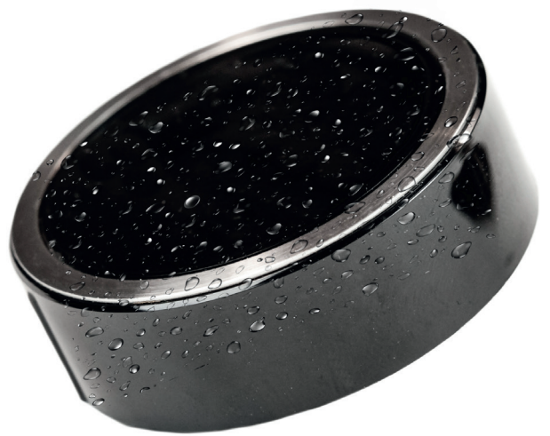
Gap-free composites metal - plastic - glass

In the field of ventilation technology, GRONBACH also develops and produces specific fan impellers with hubs, fan systems and turbines without imbalance, proven millions of times, e.g. for medical machines and computer systems, cooling or heating units and ventilation systems.