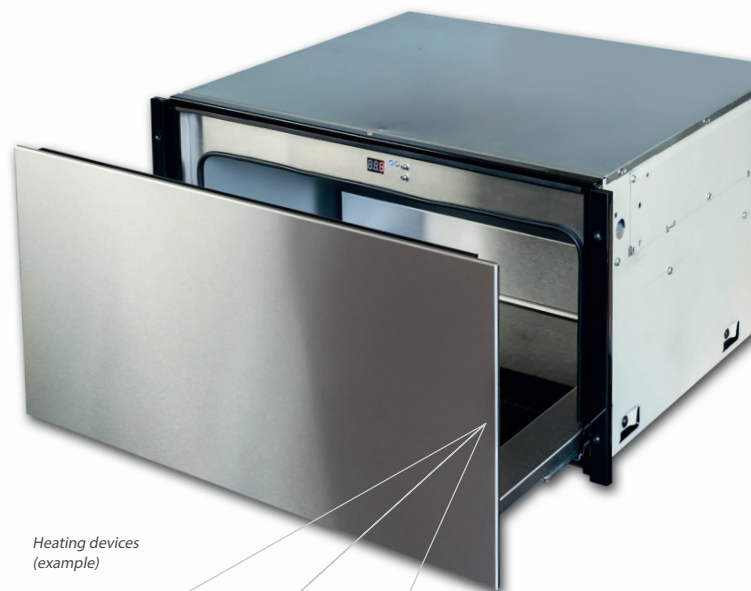
Heating devices (example)